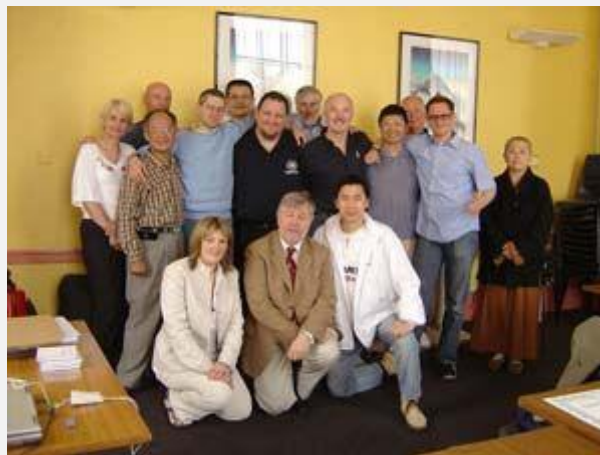
A group from 2003