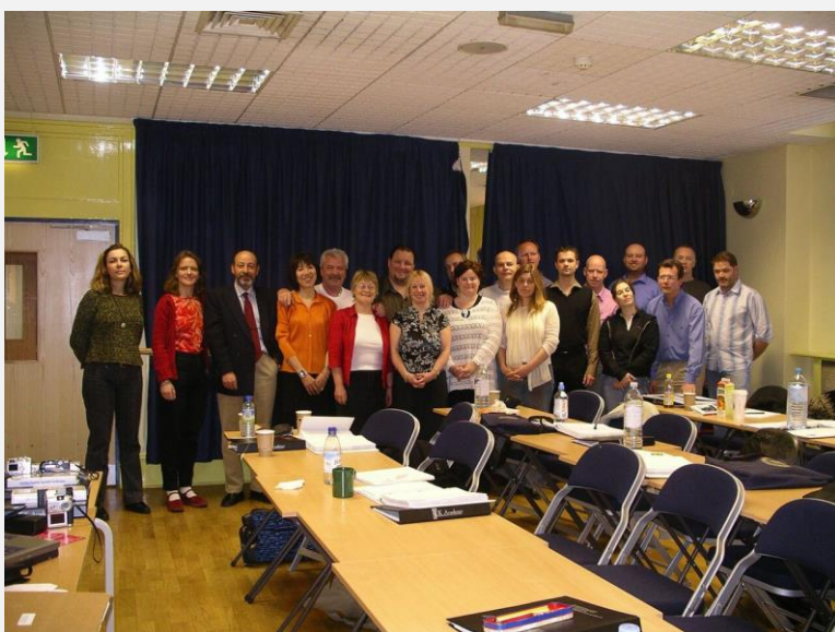
The International Certified Professional Instructor course 2005

Both the Practitioner and Master Practitioner Courses are stand alone courses in their own right, but the Practitioner Course is also contained within the Diploma in Clinical and Advanced Hypnosis.